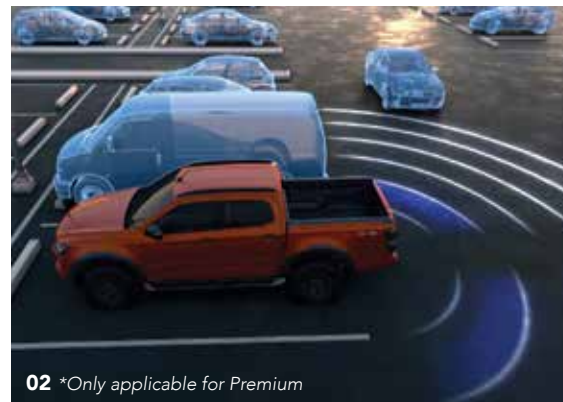
02 *Only applicable for Premium