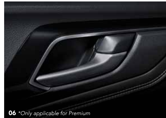
06 *Only applicable for Premium