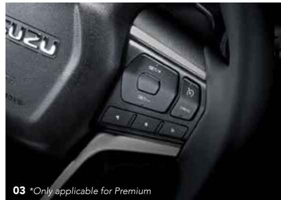
03 *Only applicable for Premium