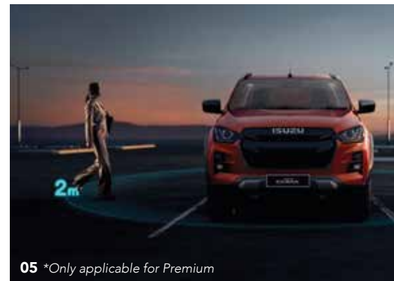
05 *Only applicable for Premium