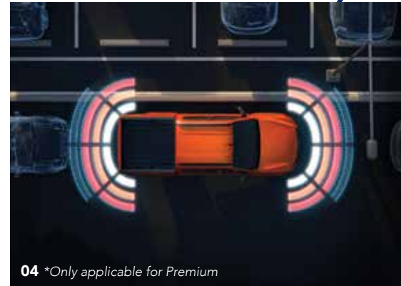
04 *Only applicable for Premium