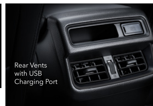
Rear Vents with USB Charging Port