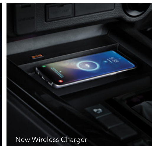
New Wireless Charger