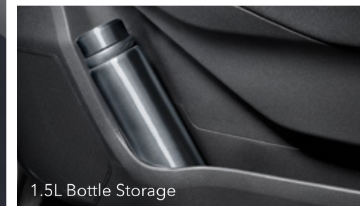
1.5L Bottle Storage

The New Isuzu D-Max Auto Plus interior greets you with New Fabric Seats Design, ample space, and practical functionality, allowing you to relax and enjoy your journeys in comfort.