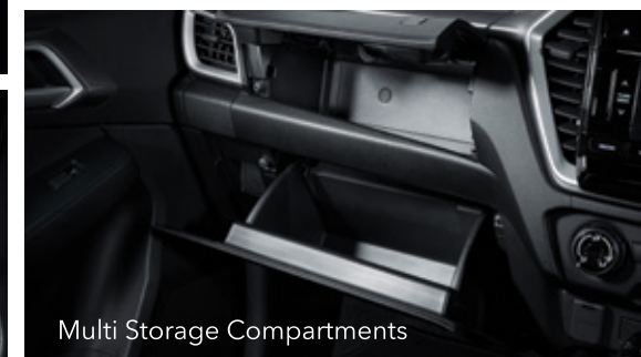
Multi Storage Compartments