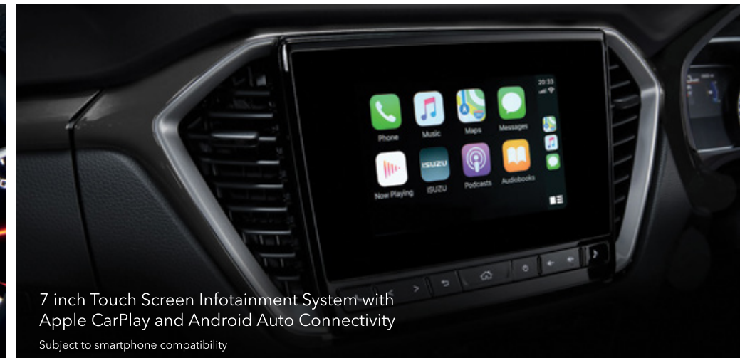
7 inch Touch Screen Infotainment System with Apple CarPlay and Android Auto Connectivity Subject to smartphone compatibility