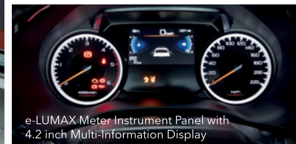
e-LUMAX Meter Instrument Panel with 4.2 inch Multi-Information Display