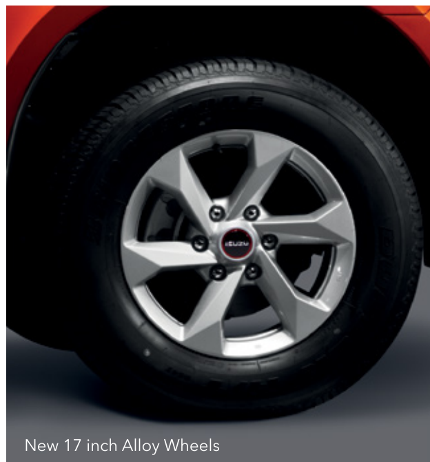
New 17 inch Alloy Wheels