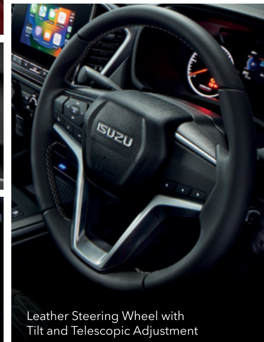
Leather Steering Wheel with Tilt and Telescopic Adjustment