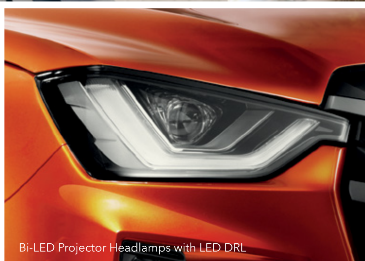
Bi-LED Projector Headlamps with LED DRL