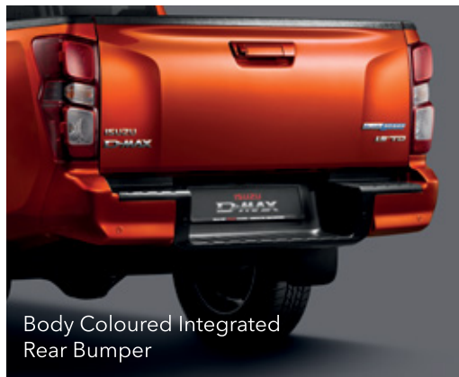
Body Coloured Integrated Rear Bumper