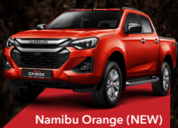
Namibu Orange (NEW)