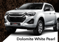
Dolomite White Pearl